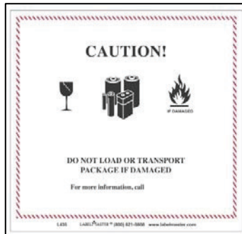
Lithium Battery Handling Label