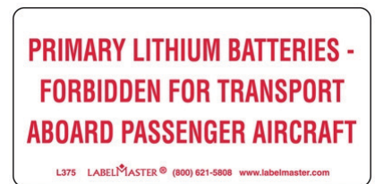
DOT Lithium Battery Marking Label