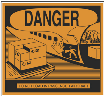
Danger Do Not Load in Passenger Aircraft Label

The following is a sample of standard hazardous material shipping labels: