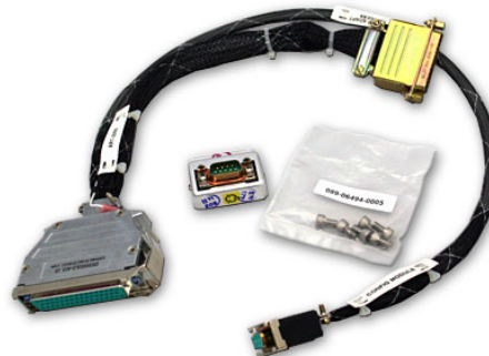
SEA Adapter Harness